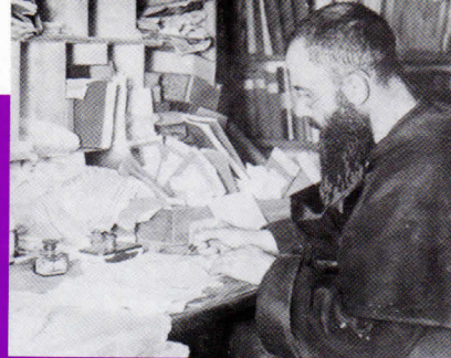
St. Maximilian writes

Thus, we can all do penance, without considering our health, occupation, and duties of our state of life.